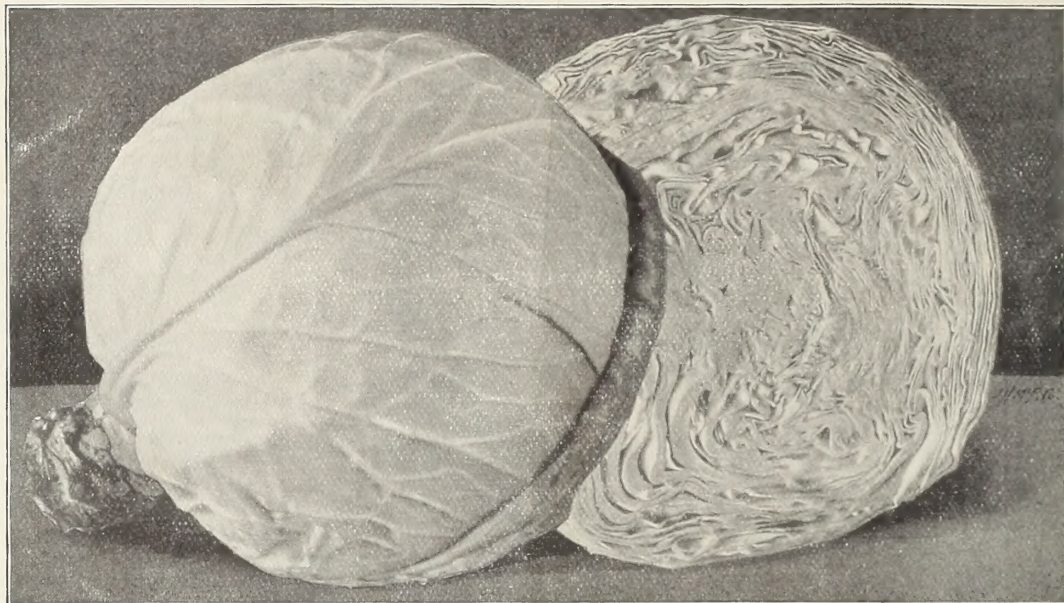
HOUSER CABBAGE, from photograph showing SHAPE and SOLIDITY of head